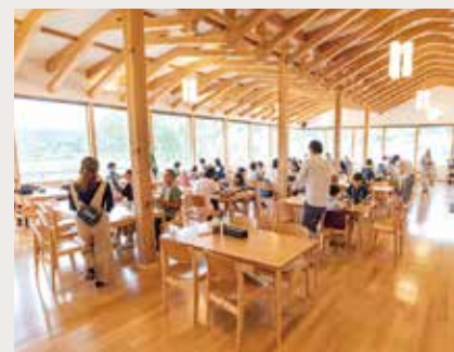
Restaurant Koikoi Shokudo