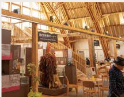
History and Folklore Section