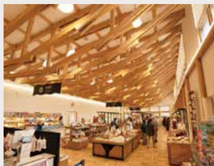
Local Produce and Souvenir Section

This natto is entirely made from locally produced Akita Shirakami soybeans grown using the rich soil and water of the Shirakami-Sanchi area. Enjoy its classic taste created with the traditional and original processing techniques enhanced with modern technologies. From 165 yen per warazuto wrapper (with tax)